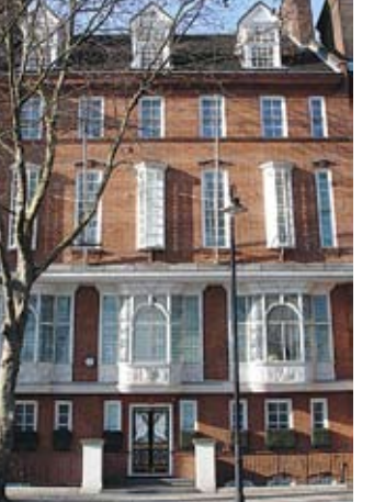
Jettied Old Swan House - TS:17 Embankment

window, the roofline 'borrowed' from the waterside houses that had stood on the site. No 37 was Ashbee's office and his mother's home >